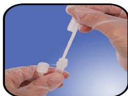
Easy sample processing

For upper respiratory tract infection diagnosis