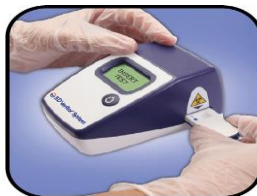
Insert and read