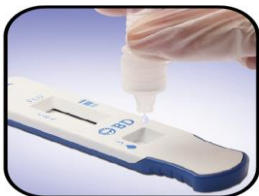
Ready in minutes